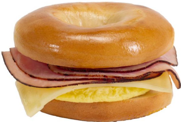
Plain Bagel: Black Forest Ham, Egg, and Swiss